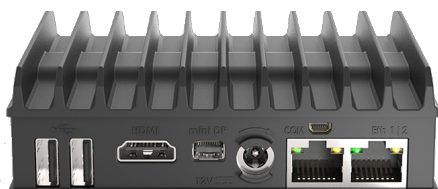
Edge Fit – Back View

Quickly add Kognitive Edge as a Service (KaaS) to any network installation