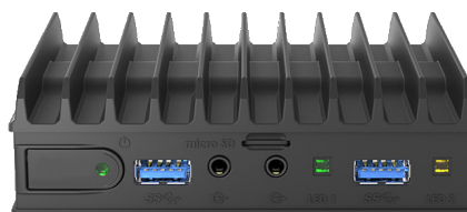
Edge Fit – Front View