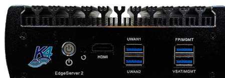
Edge Pro – Front View