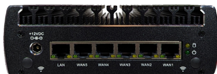
Edge Pro – Back View